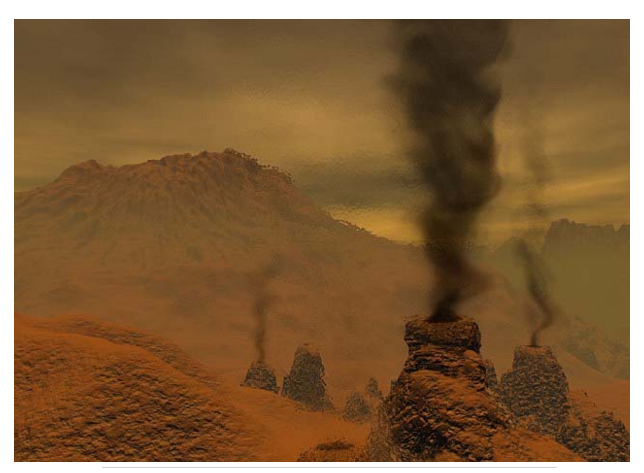
On Venus, the pitch of your voice would become much deeper. That is because the planet's dense atmosphere means that the vocal cords vibrate more slowly through this 'gassy soup'